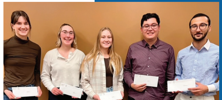
Past scholarship recipients March 2023

For several years, CMIEF has been awarding renewable scholarships of $1,000 per academic term. Recognizing the continually increasing costs associated with education, it is overdue to adjust our scholarship to better reflect the current reality of educational expenses. Our GOAL of raising $750,000 will empower the Foundation to increase both the scholarship amount and the number of recipients.